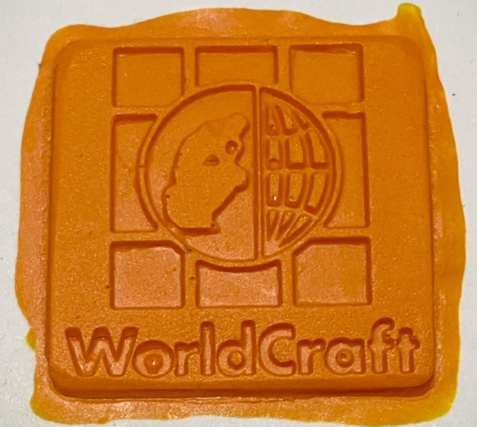
YOU CAN EVEN COPY EMBEDDED GRAPHICS AS WELL.